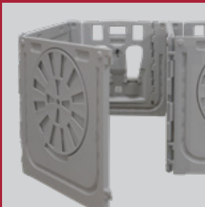
Back panel opens for easy cleaning