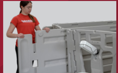
Center panel is removable for group calf housing