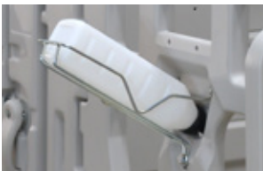
Bottle Holder: AGRI-7124