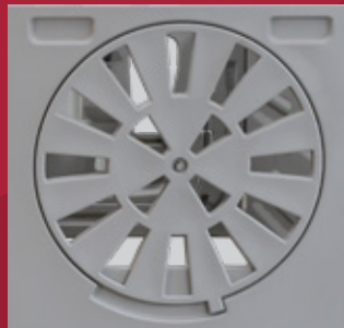
No metal parts to lose or rust on back vent