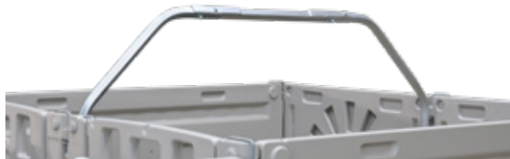
5', 6' 7' Group Housing Bar: AGRI-7113/7114/7115